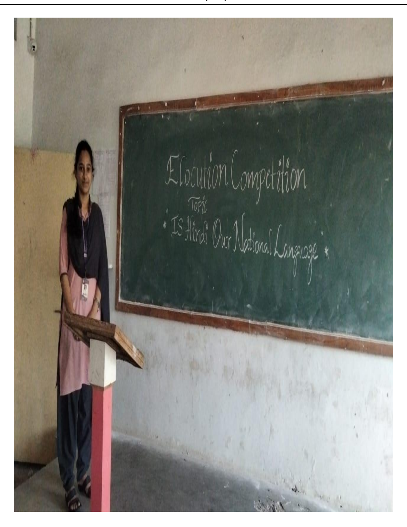
Student participating in the Elocution Competition

Cherukupally (Village), Near Tagarapuvalasa Bridge, Bhogapuram (Mandal), Vizianagaram -531162. www.aietta.ac.in, principal@aietta.ac.in