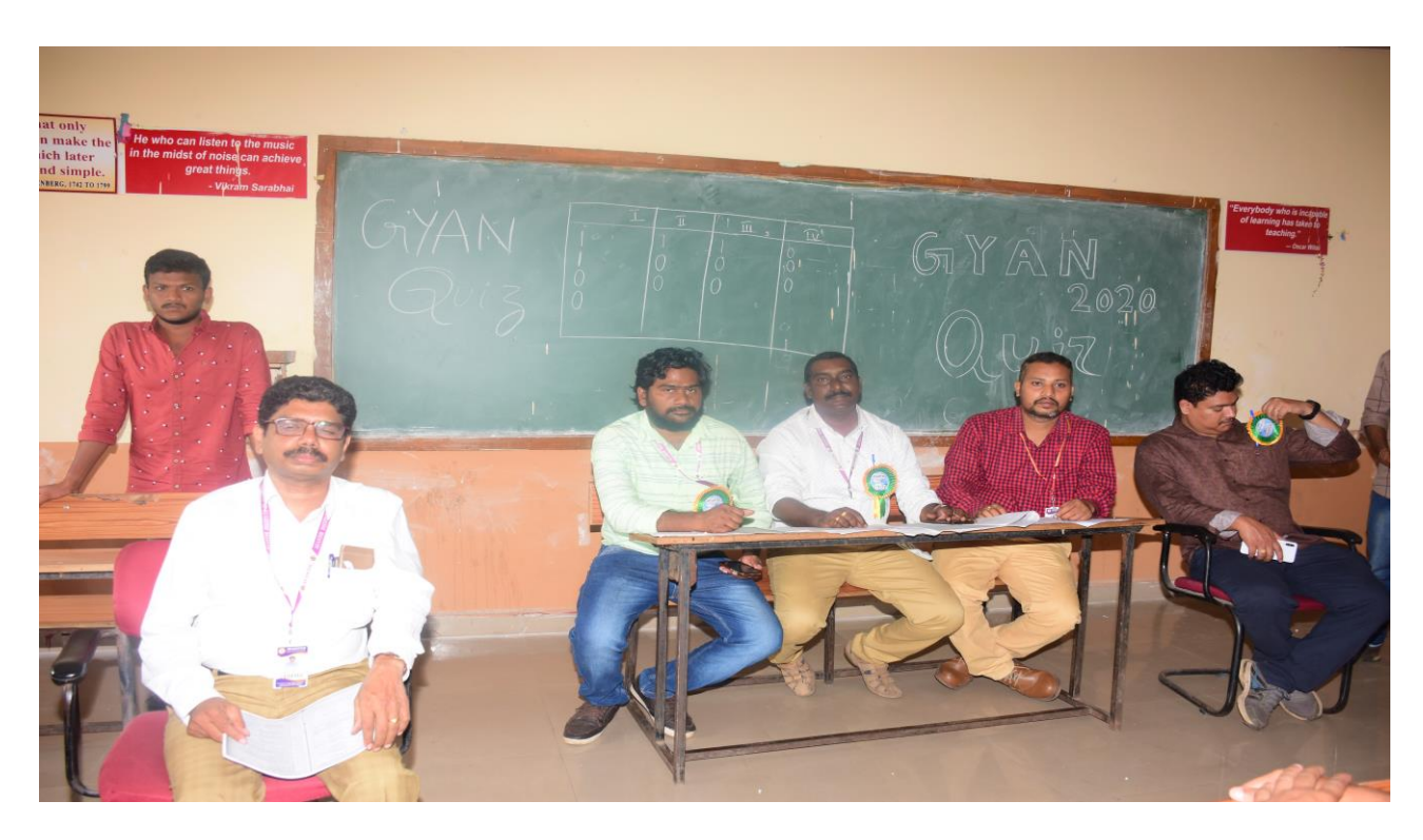
JUDGES OF THE QUIZ COMPETITION

Cherukupally (Village), Near Tagarapuvalasa Bridge, Bhogapuram (Mandal), Vizianagaram -531162. www.aietta.ac.in, principal@aietta.ac.in