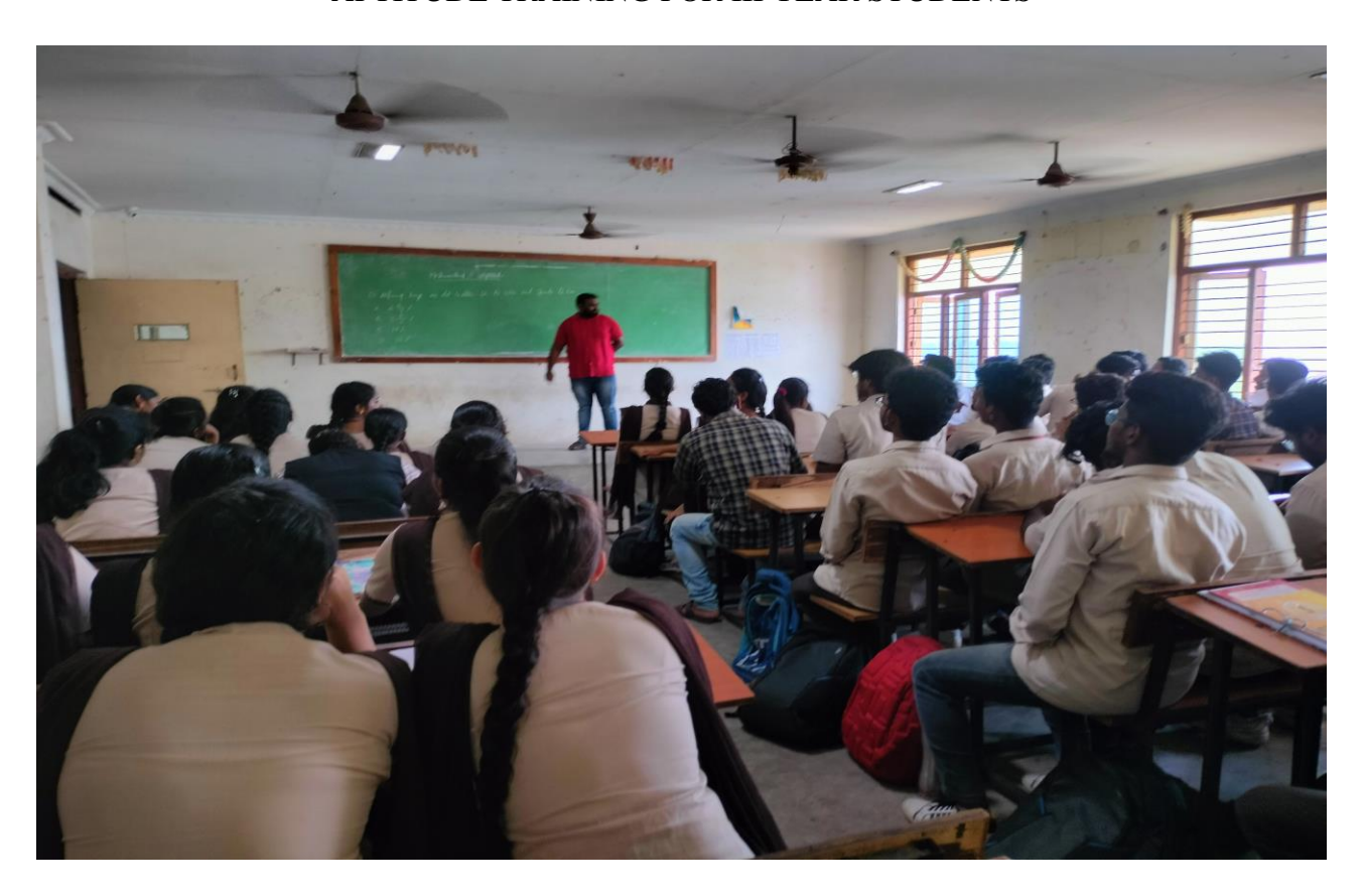
APTITUDE TRAINING FOR III YEAR STUDENTS