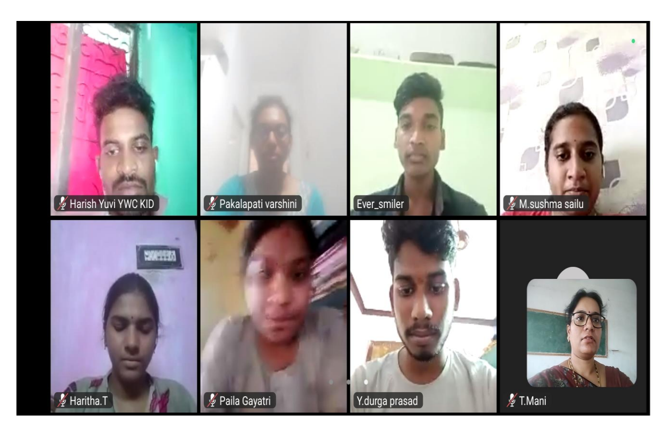
Engineering Education amid a Global pandemic

Cherukupally (Village), Near Tagarapuvalasa Bridge, Bhogapuram (Mandal), Vizianagaram -531162. www.aietta.ac.in, principal@aietta.ac.in