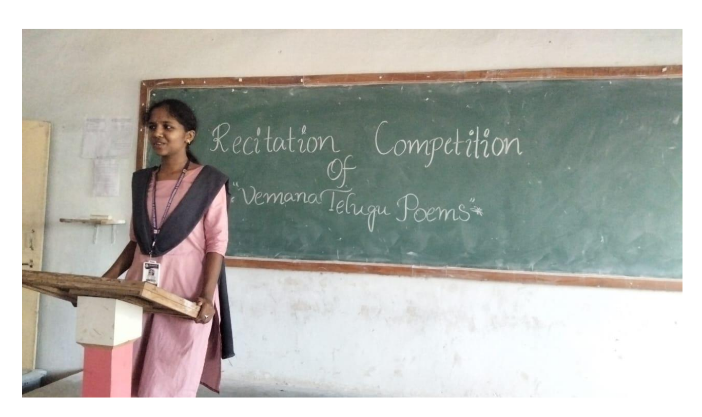
RECITATION COMPETITION FOR I YEAR STUDENTS

Cherukupally (Village), Near Tagarapuvalasa Bridge, Bhogapuram (Mandal), Vizianagaram -531162. www.aietta.ac.in, principal@aietta.ac.in