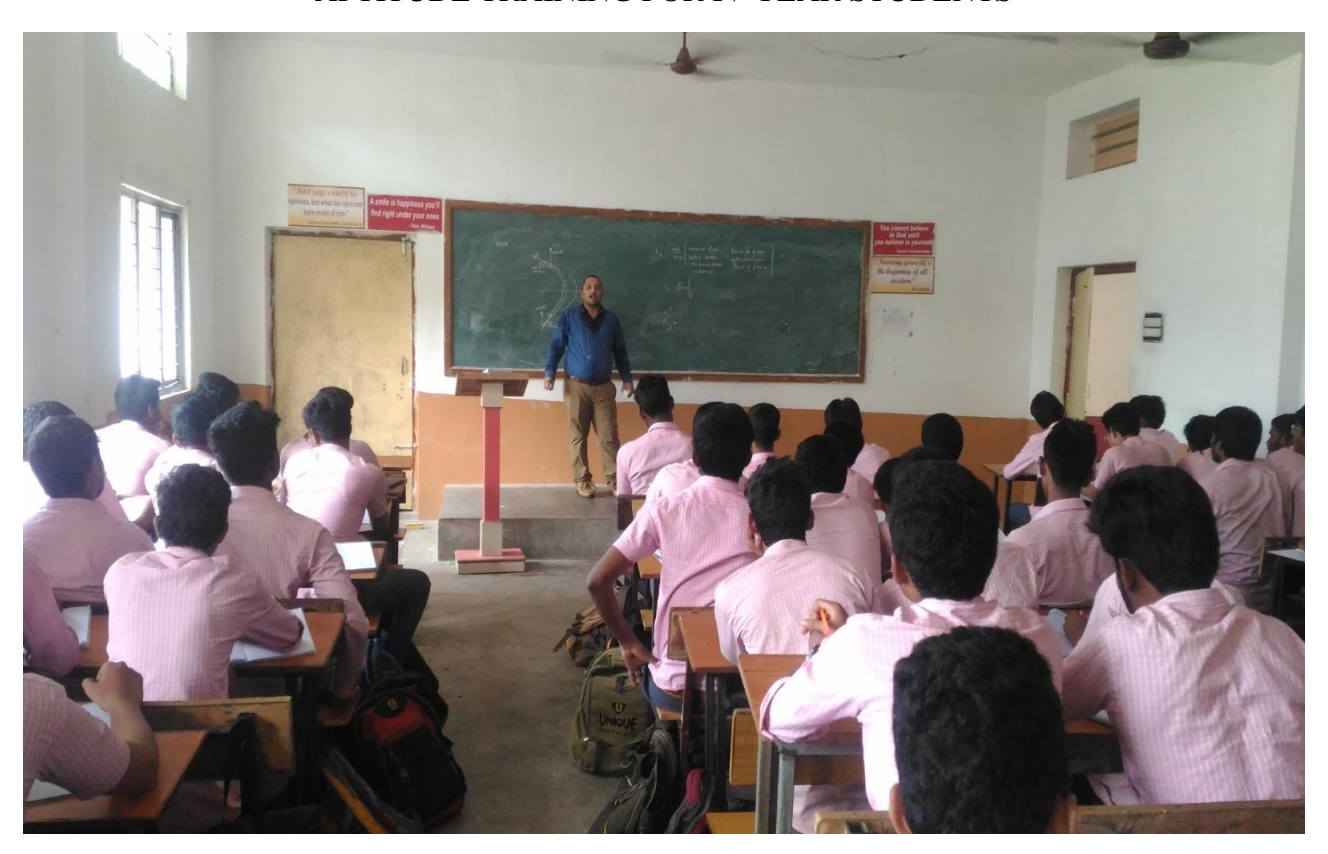
APTITUDE TRAINING FOR IV YEAR STUDENTS