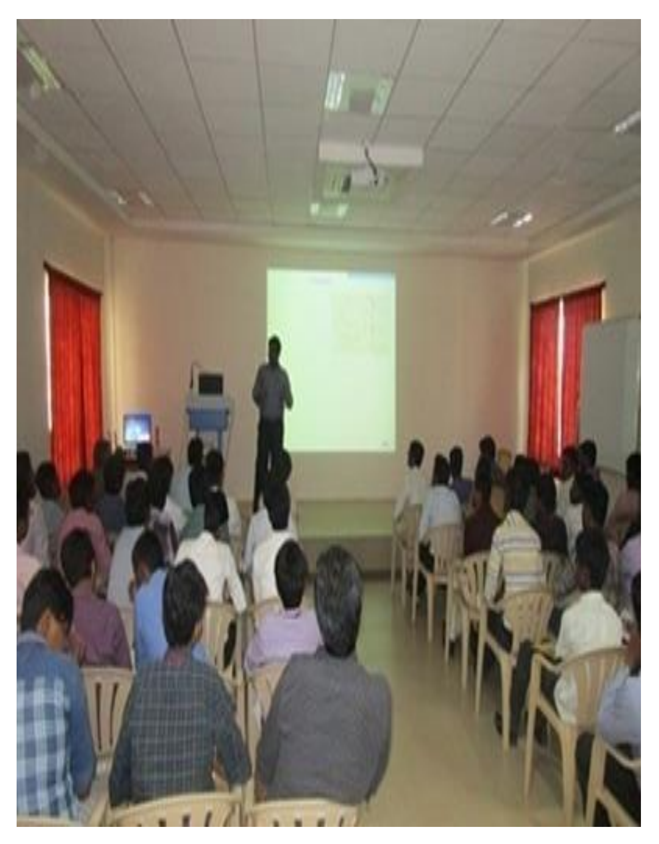
GATE ORIENTATION SESSION-2020

www.aietta.ac.in, principal@aietta.ac.in