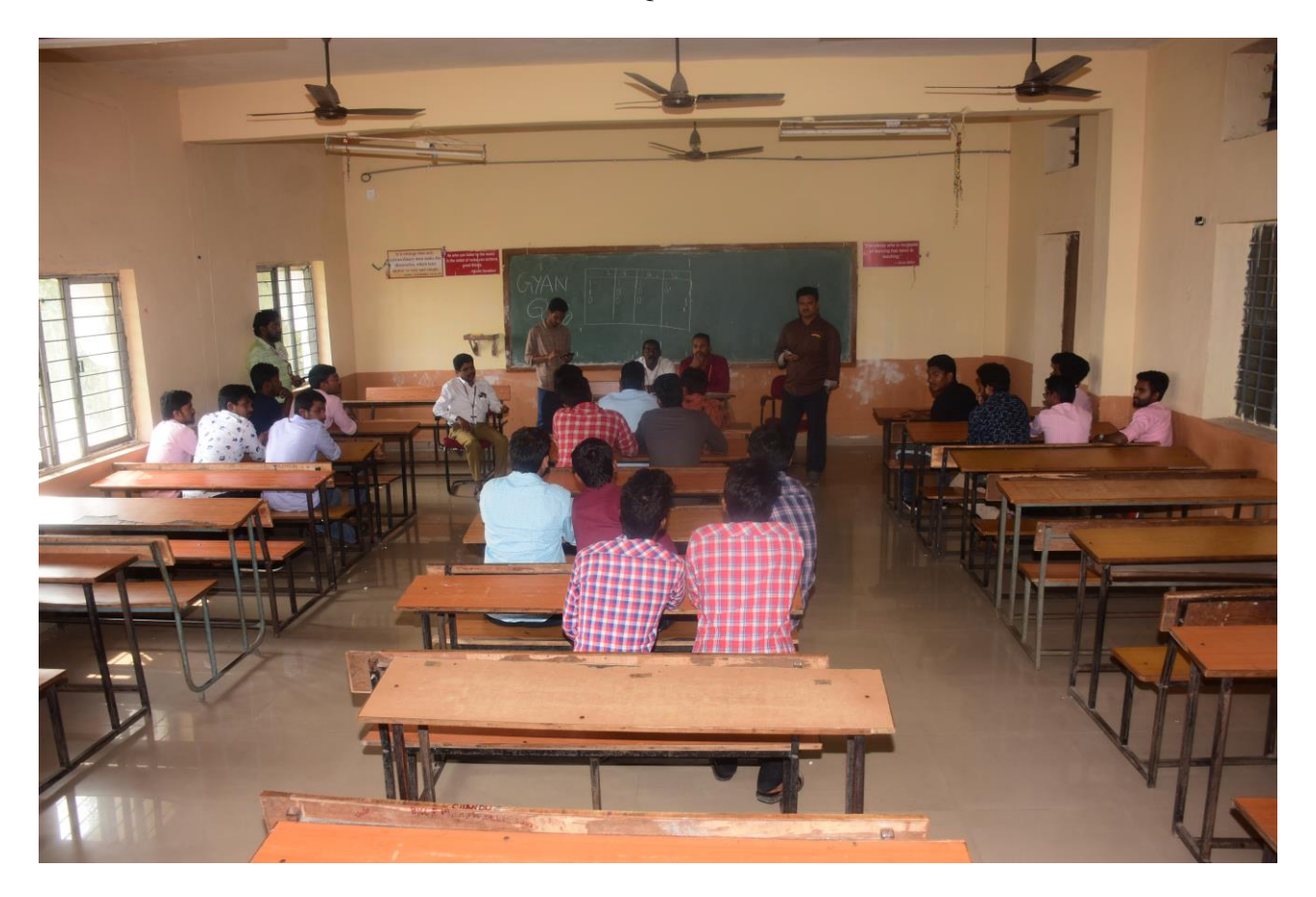
QUIZ COMPETITION CONDUCTED BY MECHANICAL DEPARTMENT