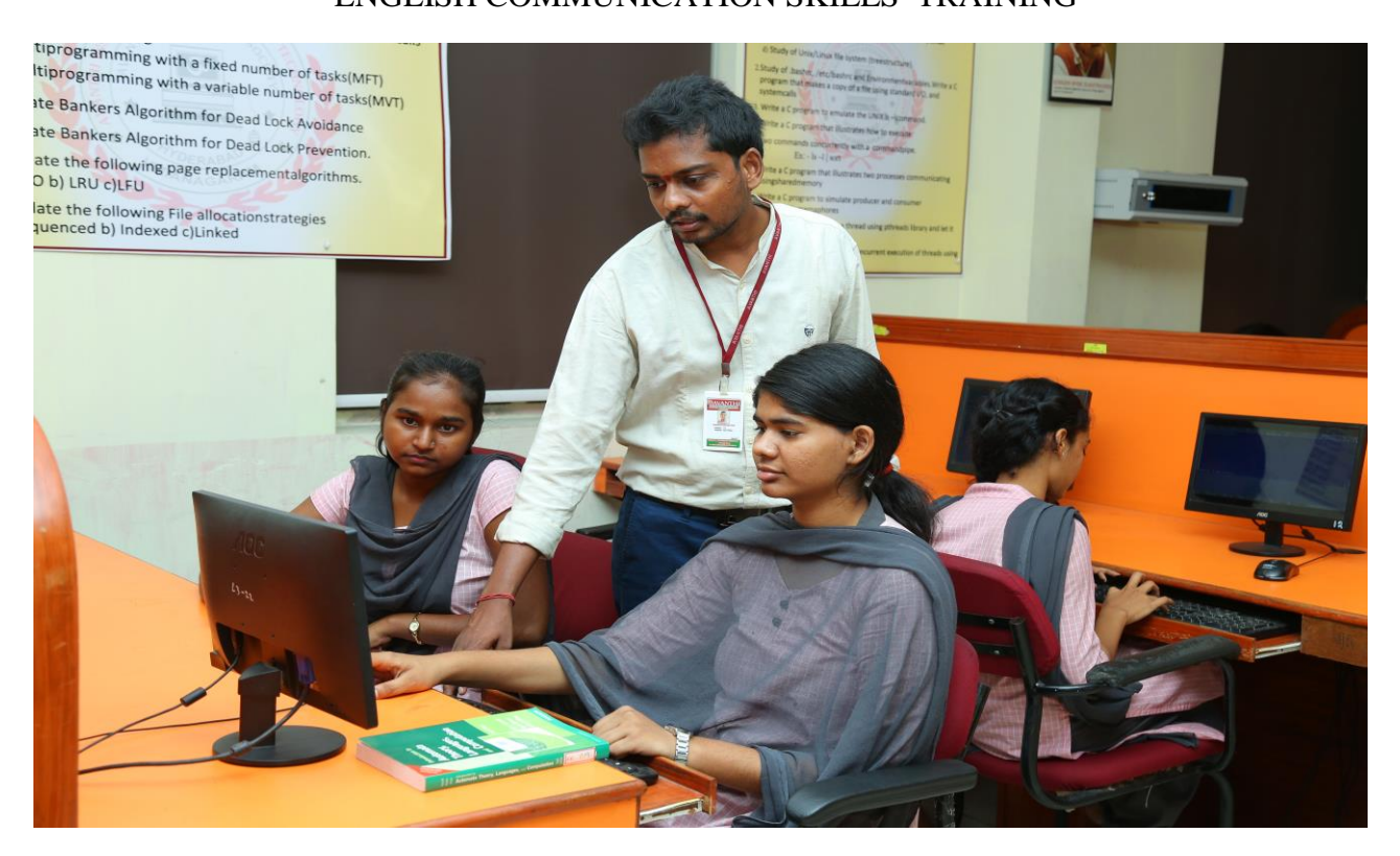
ENGLISH COMMUNICATION TRAINING