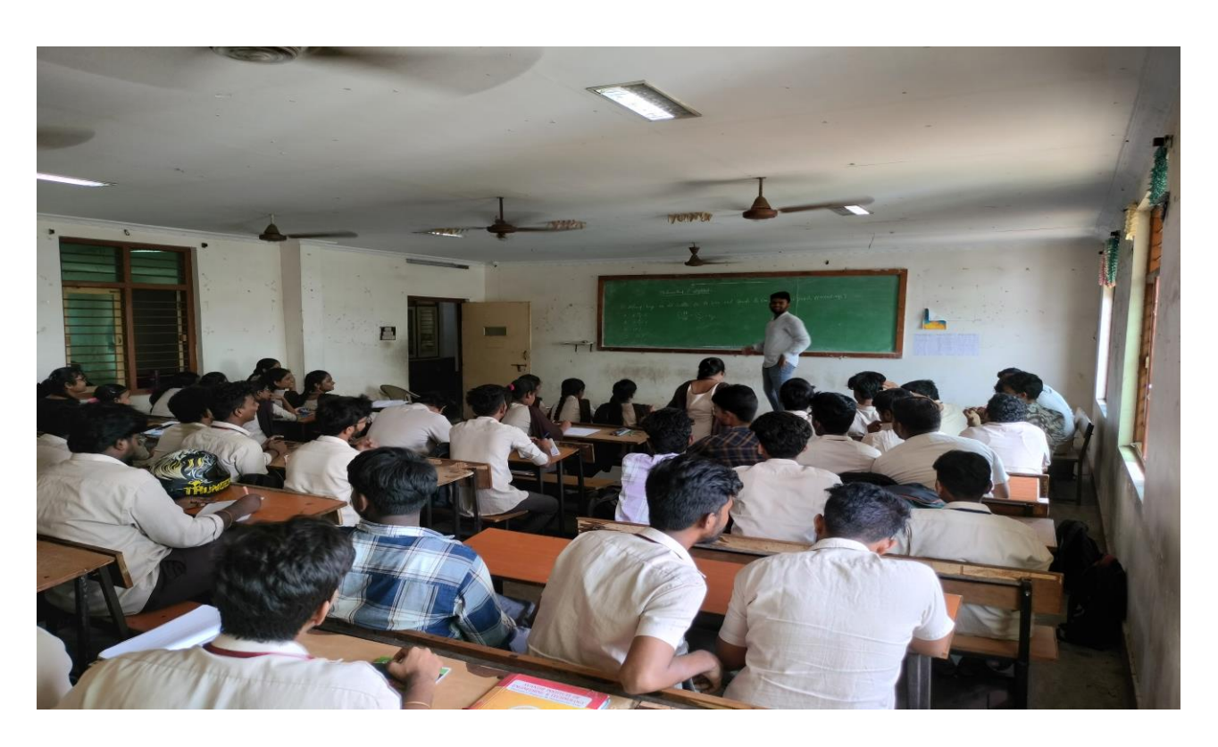
APTITUDE TRAINING FOR III YEAR STUDENTS

Cherukupally (Village), Near Tagarapuvalasa Bridge, Bhogapuram (Mandal), Vizianagaram -531162. www.aietta.ac.in, principal@aietta.ac.in