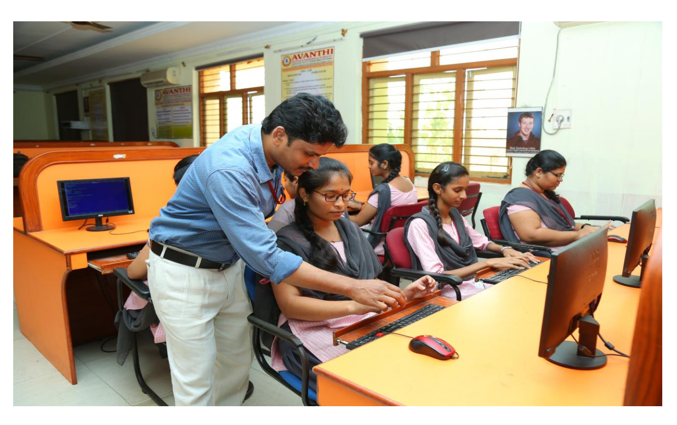
RESUME WRITING FOR III YEAR STUDENTS

Cherukupally (Village), Near Tagarapuvalasa Bridge, Bhogapuram (Mandal), Vizianagaram -531162. www.aietta.ac.in, principal@aietta.ac.in