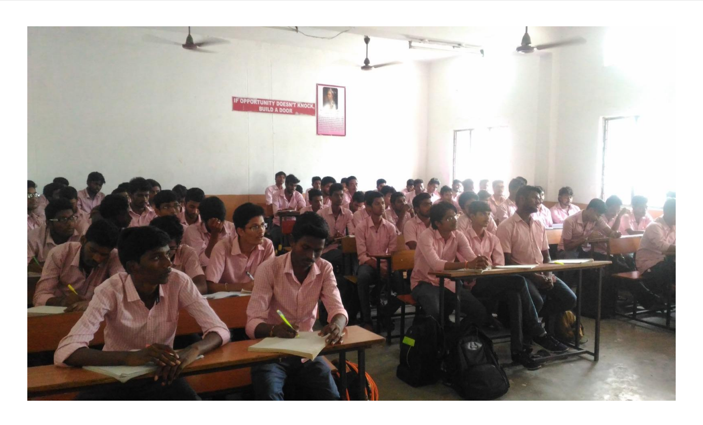
APTITUDE TRAINING FOR IV YEAR STUDENTS

Cherukupally (Village), Near Tagarapuvalasa Bridge, Bhogapuram (Mandal), Vizianagaram -531162. www.aietta.ac.in, principal@aietta.ac.in